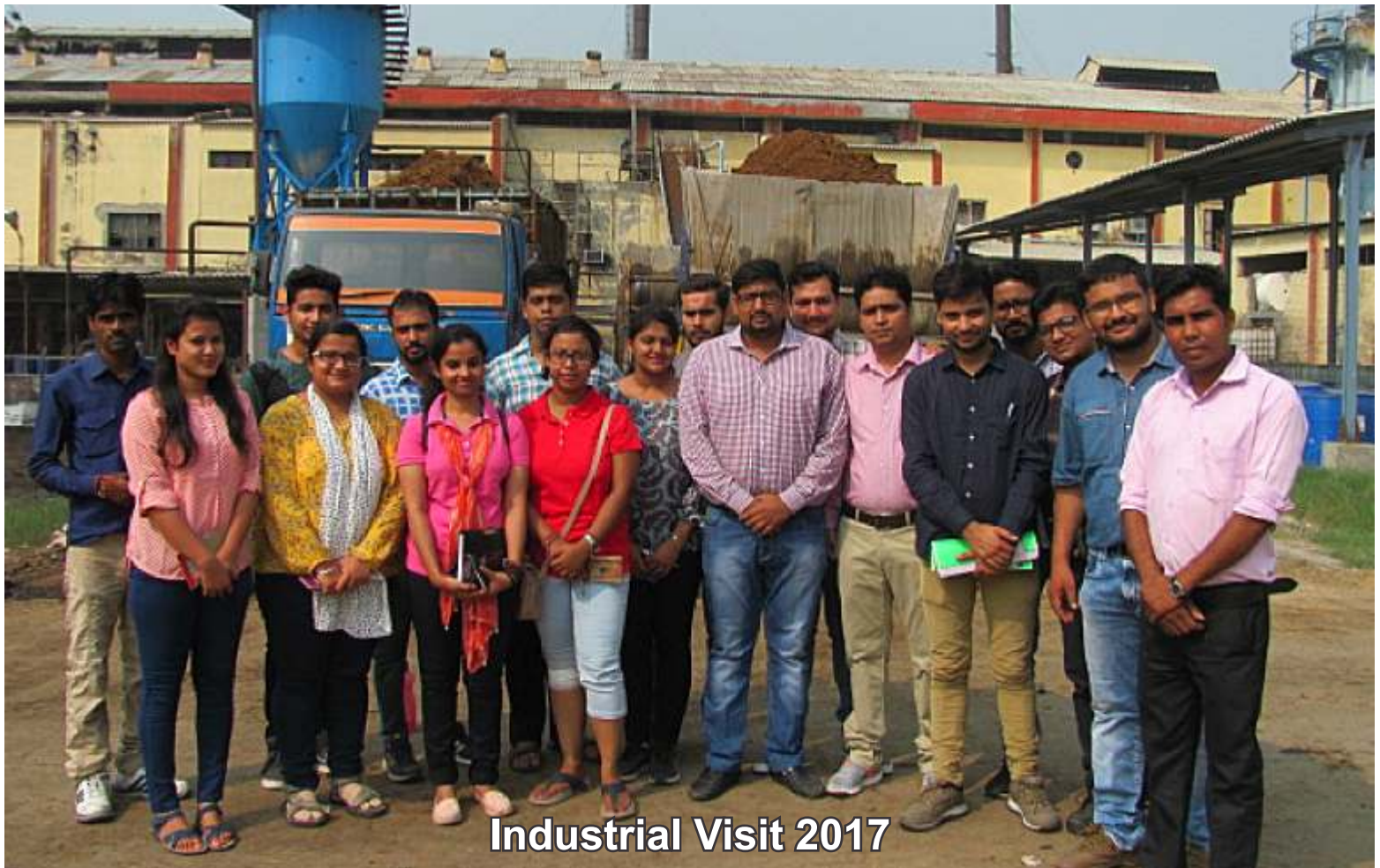
Industrial Visit 2017